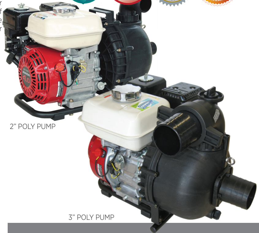
2" POLY PUMP