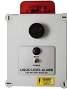
BATTERY BACKUP & SOLAR