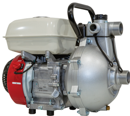
GP160 | RECOIL