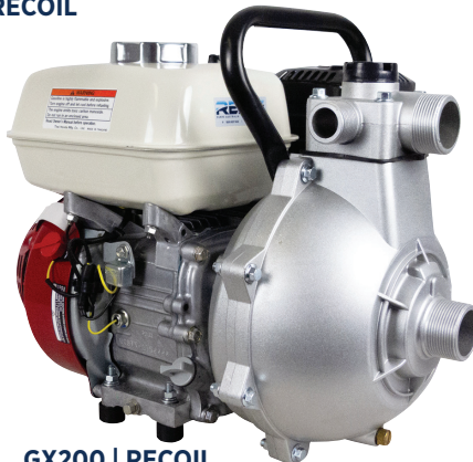
GX200 | RECOIL