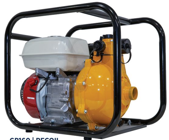
GP160 | RECOIL