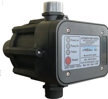
8577.PC is supplied with REEFE RPC15ADS Pressure controller (code: 8744.QP) & plug cover