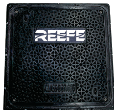
CLASS B COMPOSITE COVER