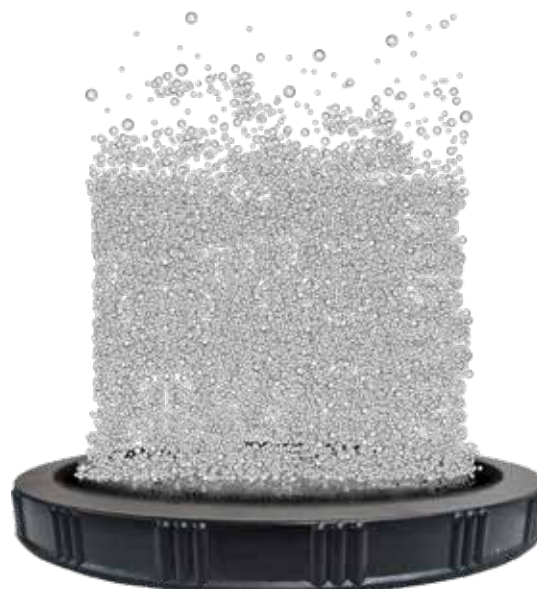
FINE BUBBLE PATTERN FOR MAXIMUM AERATION