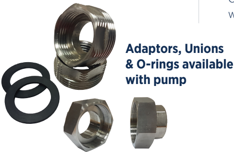
Adaptors, Unions & O-rings available with pump