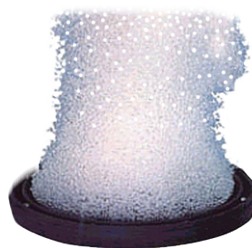
FINE BUBBLE PATTERN FOR MAXIMUM AERATION