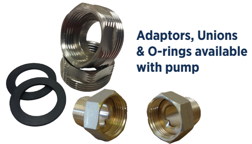
Adaptors, Unions & O-rings available with pump