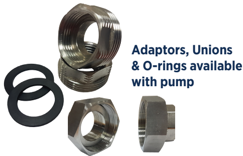
Adaptors, Unions & O-rings available with pump