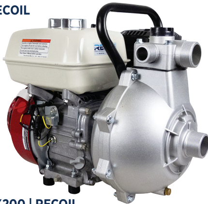
GX200 | RECOIL