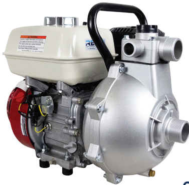
GX160 & GX200 | RECOIL