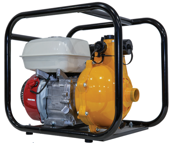
GX200 | RECOIL