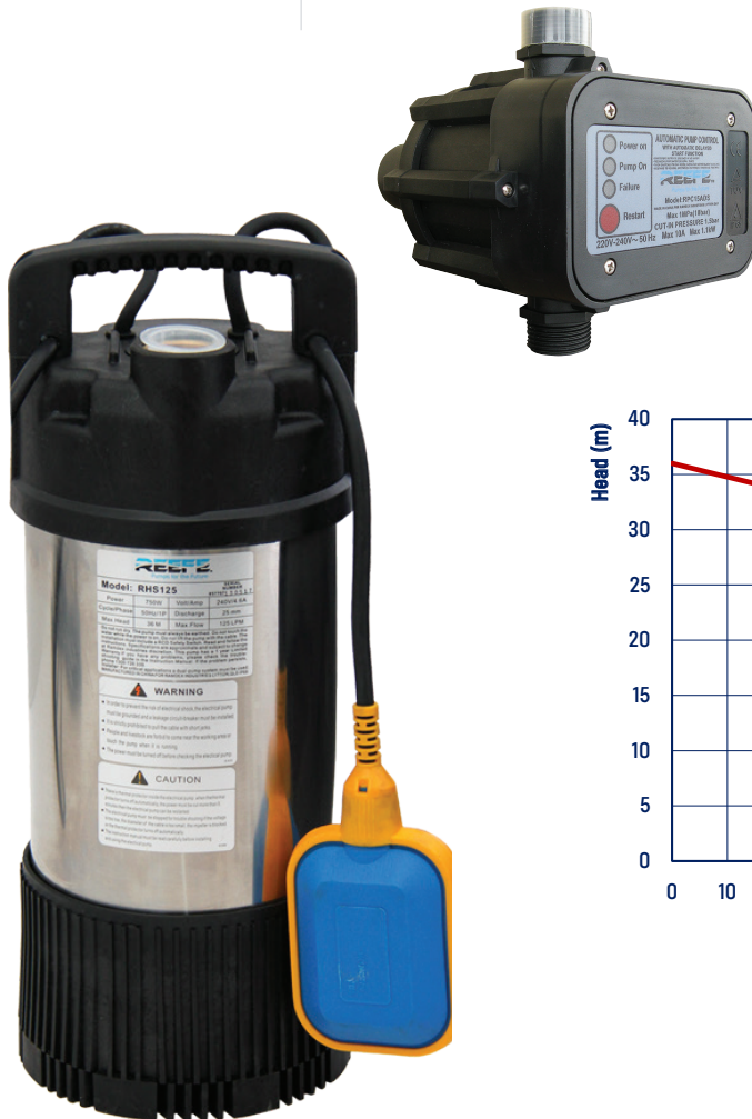
35108 is supplied with REEFE RPC15ADS Pressure controller (code: 1776) & plug cover