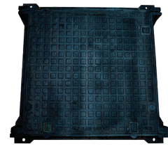
CLASS D COVER