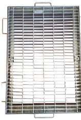
CLASS B GRATE & FRAME