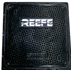
CLASS B COMPOSITE COVER