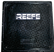
CLASS B COMPOSITE COVER