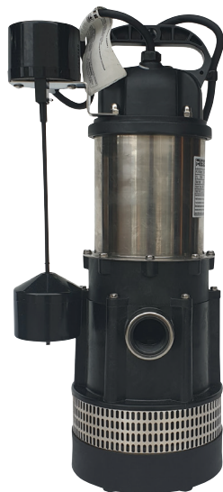
RHS105VF | 20043