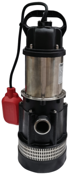
RHS105 | 20036