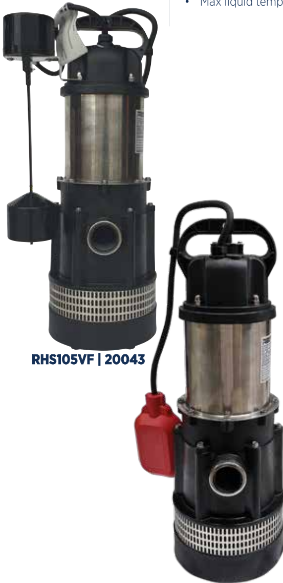
RHS105VF | 20043