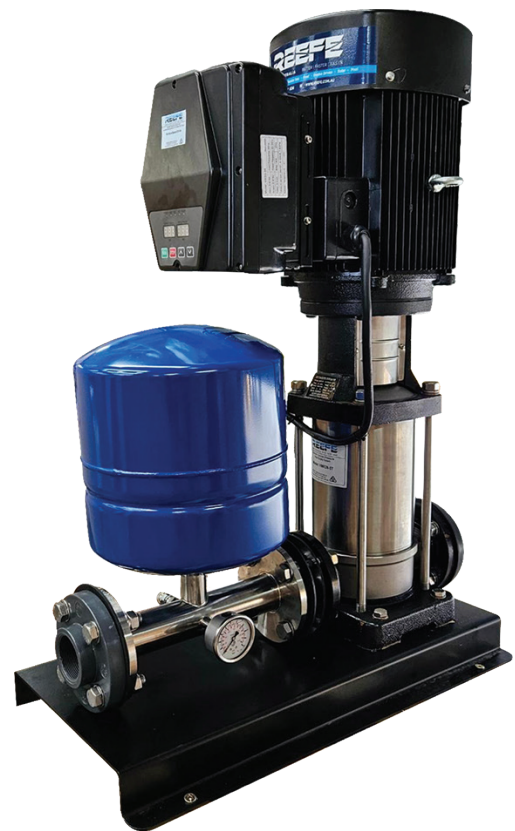
More sizes available on request.