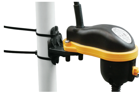
21866 | IMAGE 1