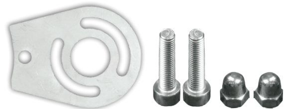
22382 | IMAGE 2