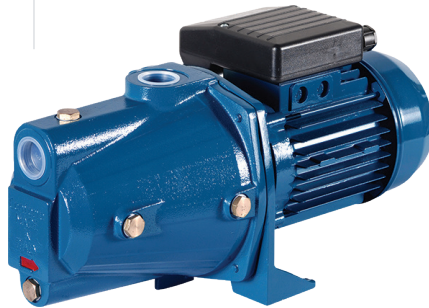
RSWE | PUMP ONLY