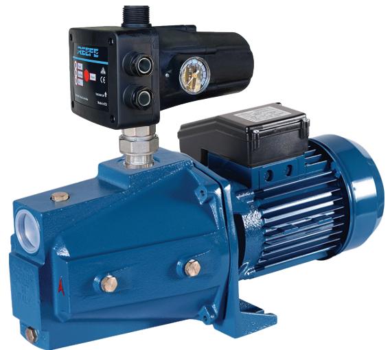
RSWE | PC