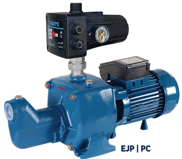
EJP | PC